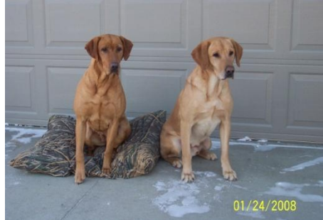
Browning (left) & Cash (right)

Intelligent, great disposition, with extraordinary drive & nose Very athletic with awesome Lab features